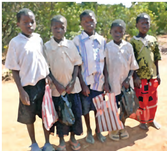
School boys in Tanzania.