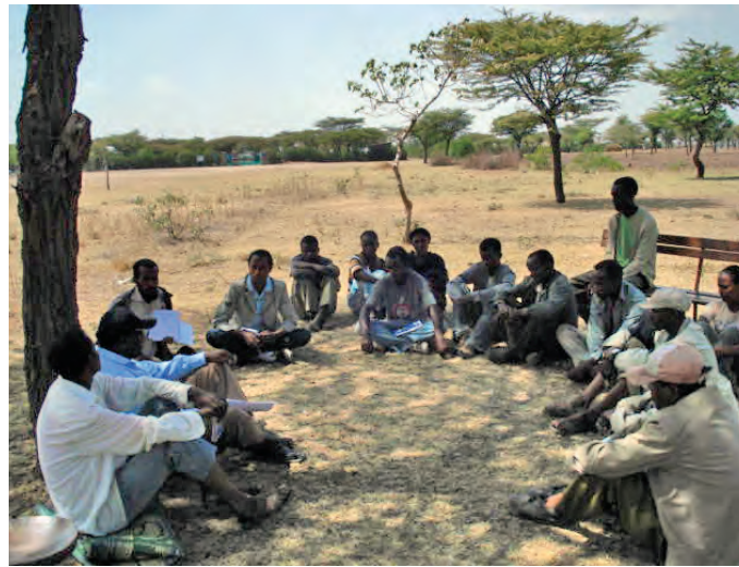
Left: QI team in Meki, Ethiopia.