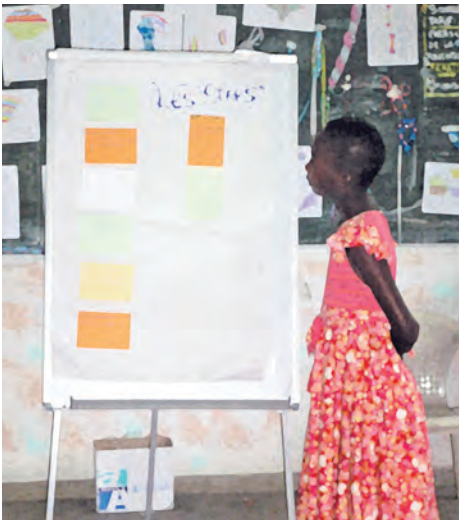
Far Left: A participant in a youth workshop to review draft OVC standards in Côte d'Ivoire.